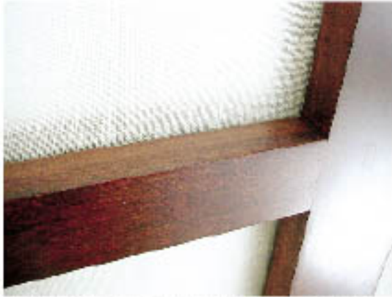
Type 1 lattice-custom stained frame with oyster linen acrylic