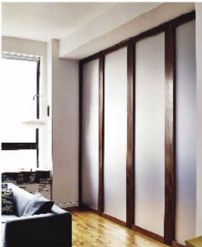
Top: SW3 - custom stained, type 4 lattice frames and clear frosted acrylic