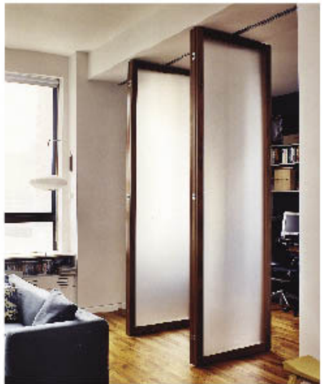
Bottom: FC4 - walnut frame and clear frosted acrylic