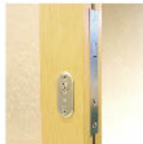
privacy lock, AGB