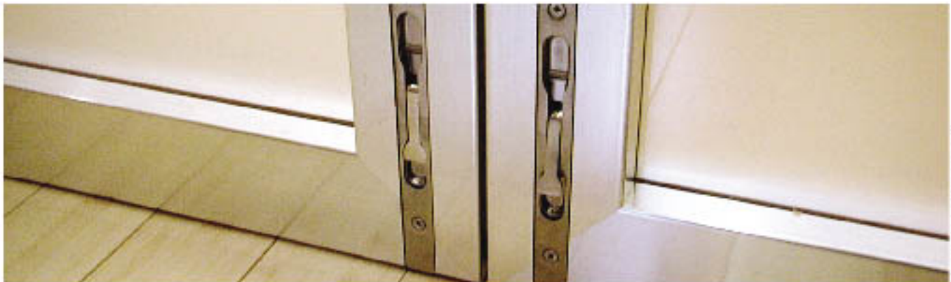
S25-brushed aluminum frame with clear frosted acrylic, flush bolts #330