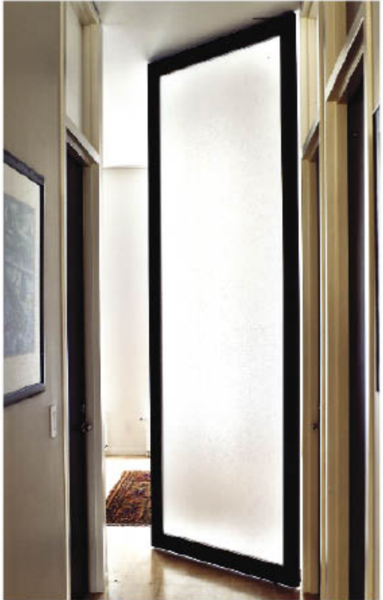
PV1 - coffee wood frame and oyster linen acrylic