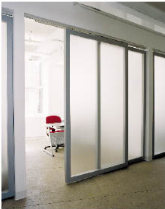
S82-metallic mesh frame and clear frosted acrylic