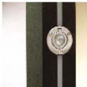
edge mounted ring pull