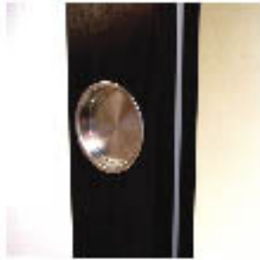
flush pull #60