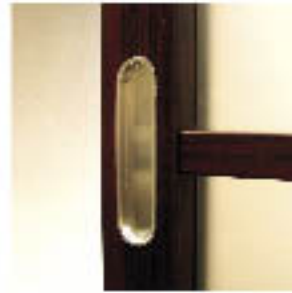
flush pull #150