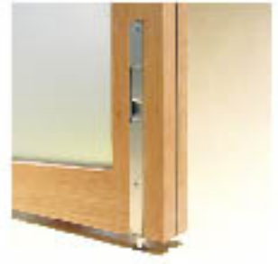
flush bolt, LT 38