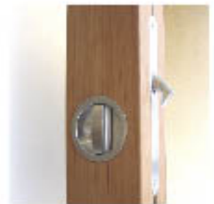
privacy lock, KA

Standard finish is brushed chrome/stainless.